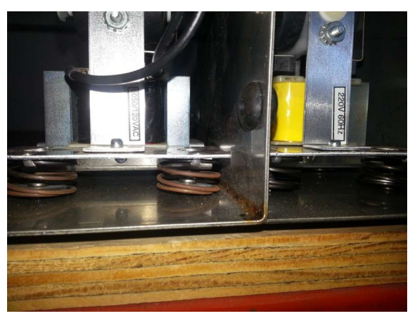
The metal spring show oxidation from ozone leaking inside of unit.

This pump ran for one week, notice the intake filters on left heavily oxidized